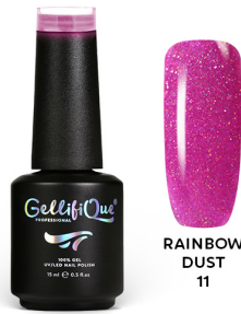
RAINBOW DUST 11