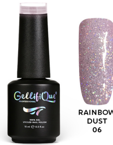
RAINBOW DUST 06