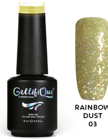
RAINBOW DUST 03