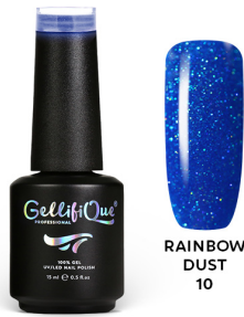
RAINBOW DUST 10