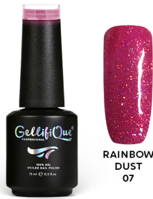
RAINBOW DUST 07