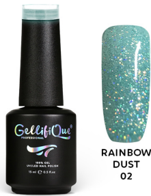
RAINBOW DUST 02