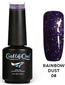
RAINBOW DUST 08