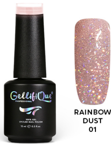
RAINBOW DUST 01