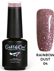
RAINBOW DUST 04